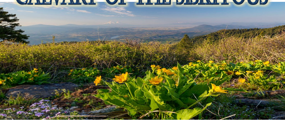
Enter His gates with thanksgiving, and into His courts with praise.