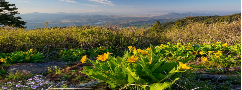
Enter His gates with thanksgiving, and into His courts